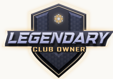
Legendary Club Owner · Global