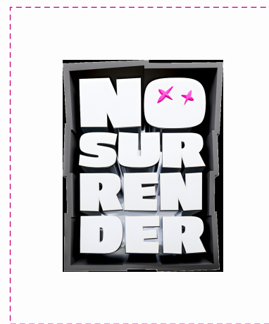
No Surrender — 25% clear space