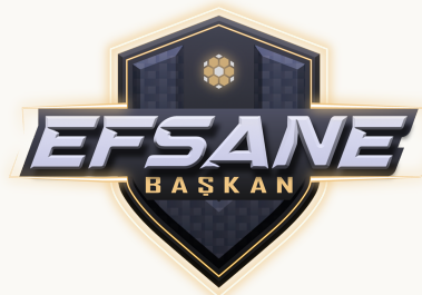
Efsane Başkan · Türkiye

Legendary Club Owner is a free-to-play, skill-based football management game. Users own and run their virtual club by handling tactics, transfers, staff and stadium and compete on a global leaderboard across seasons of 1 to 3 months. At the end of each rewarded season, real cash rewards are distributed to every player on the leaderboard, funded by advertising and sponsorship revenue rather than user contributions.